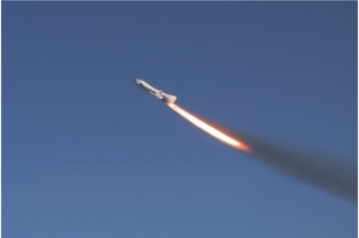
Figure 2. Scaled Composites' SpaceShipOne on its way to winning the Ansari X-Prize by reaching space.