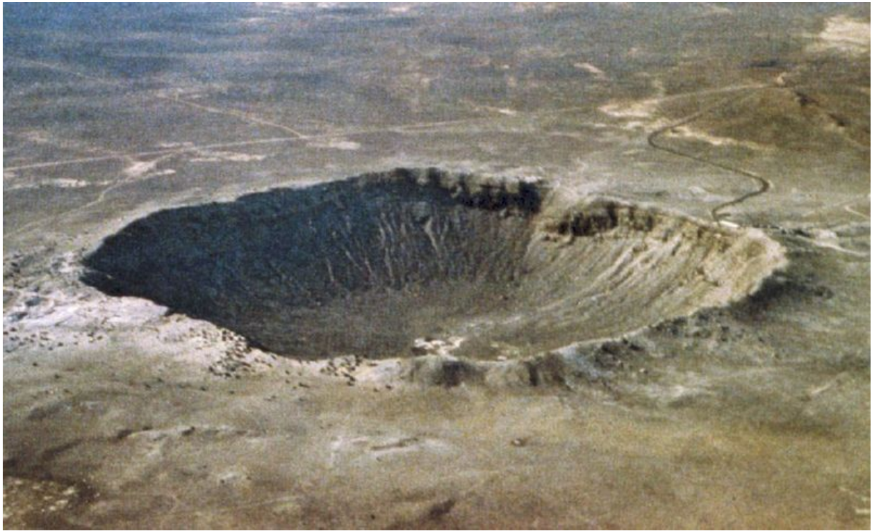
Figure 5. Meteor Crater in Arizona.

geosynchronous orbit. It was detected only two days in advance, not nearly enough time for deflection. On 23 March 1989 NEO 1989FC with the potential impact energy of over 1000 megatons (roughly the equivalent a thousand of the most powerful nuclear bombs) missed Earth by about six hours. 16 1989FC was detected eight days after closest approach. If it had come in six hours later it could have killed millions.