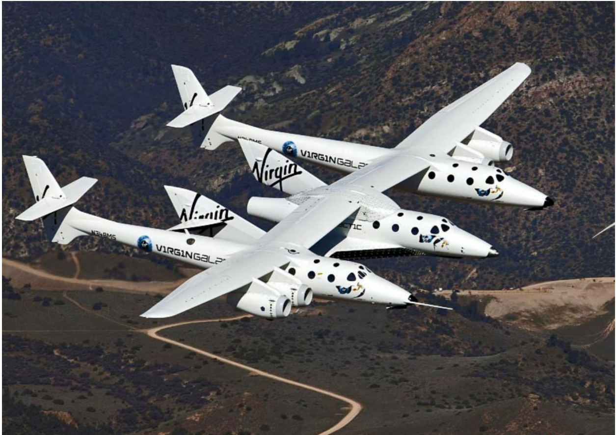
Figure 3. Virgin Galactic SpaceShipTwo in flight test. It is expected to carry paying customers soon.