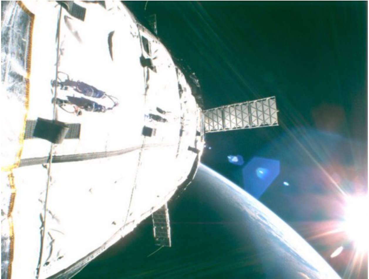
Figure 4. Bigelow Aerospace's Genesis I sub-sized space station in orbit.